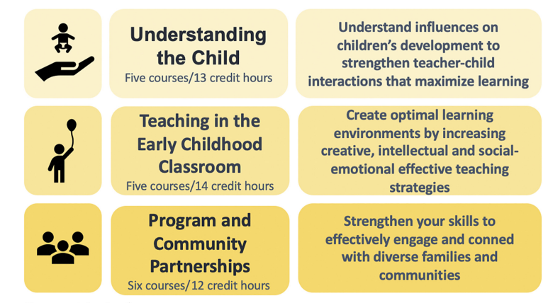
Figure 2. Themes and credit hours across stackable certificates

Making professional pathways affordable. Partners prioritized the investment of resources to fully fund ECC educators' enrollment. With the establishment of a memorandum of